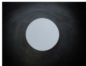
Stavros. Los Angeles, Dec 2008